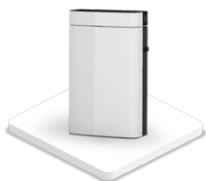
Energy Storage Battery