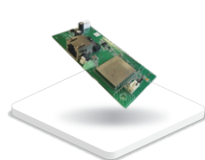
Optional Wi-Fi/Ethernet Stick