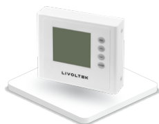
Optical LCD Screen