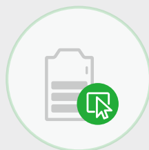
Functional With or Without a Battery