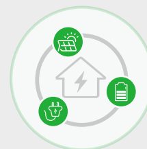
Automatically Switch PV/AC/Bat Priority